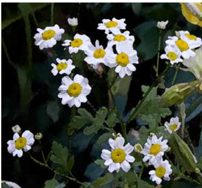
Feverfew from Bev's Garden

Would those of you who attended please e-mail your favorite four or five pictures to Amy at webwench@slmg.org . Be sure to include your best blue. The photos will be assembled into a slide show for July's meeting and anyone who sends images will receive a CD of the slide show. Feel free to contact Amy by e-mail or phone, if you have any questions.